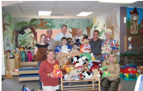
St. John's Masonic Lodge's donation of stuffed animals to the CAC's Teddy Bear Alley!