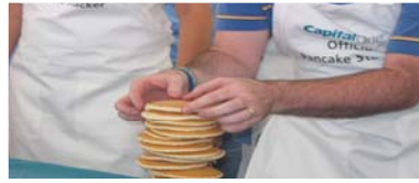
Capital One celebrated its grand opening in Tyler with a pancake stacking contest for non-profit organizations on August 26 at their new building on Hwy 155 and Loop 323.